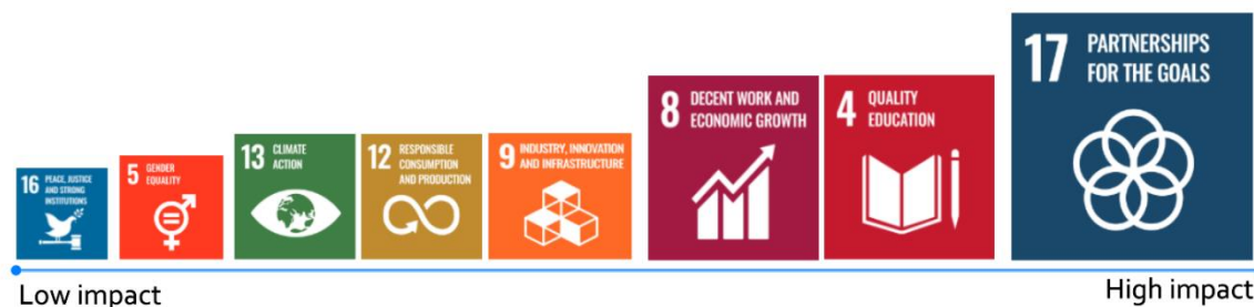
Figure 2: Degree of impact on UN SDGs

Visolit has identified a significant impact on eight of the UN Sustainable Development Goals. Partnerships are fundamental in ensuring a sustainable development in the areas we operate in. It is an integral part of our strategy and it is also in line with our core value of achieving together. Through the partnerships Visolit believes that we can contribute to positive development within all the areas of the UNGC and the UN Sustainable Development Goals. The illustration below indicates Visolit's relative positive impact on the selected Sustainable Development Goals, based on the activities and initiatives we do today.